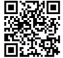
GIVING with VANCO

Do you remember Pastor’s sermon about Easter Heartburn last month? I think we are experiencing some of that this month. While April found our net income up by $5,491, May found it down $5,827. We had three big weekends in a row with Palm Sunday, Easter Sunday and Senior Sunday then our attendance and giving fell off after that as we hit the busy summer season. We also had our annual insurance premium of $3,256 get paid this month. Keep in mind our net income for the year is only off by $950. While we would love to see this be a positive number, remember we are only six months into paying a pastor’s salary versus simply supply pastor and we are still getting used to this. Summer is typically slower as attendance drops off, but the fair stand will help bridge that gap. These last few months are a good reminder why electronic giving can be so helpful to the church council and the resource team have a more even budget and can plan on what to expect is coming in each month.